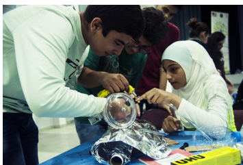
United by Environment

In the quarter September – December, ULYP had more programs running simultaneously than ever before. With over 1000 participants in programs every week, including Sundays, it was our busiest ever period. In December most of our programs came to a close for the winter break. Children, youth and women on Skills4Life, ACT, SAWA, United by Environment, and three sub-components of CIRCLE – Young Learners, Mothers, and Team Sports Camps, all participated in closing ceremonies, receiving certificates and program souvenirs and celebrating their achievements over the term. Participants on RARE will attend their closing ceremony in early 2015, when Skills4Life, ACT and United by Environment will begin again. ULYP is very thankful to all our donors, partner organizations, teachers, facilitators and volunteers, who helped make 2014 so successful.