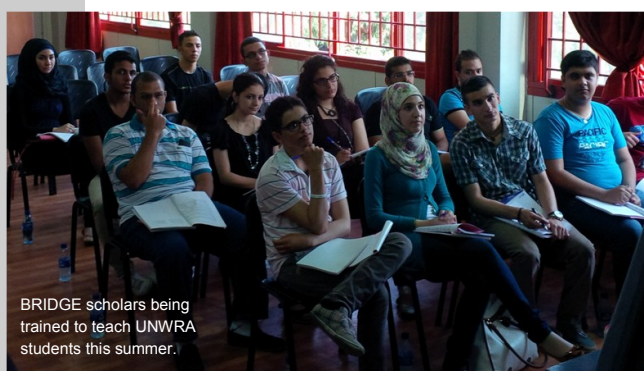
BRIDGE scholars being trained to teach UNWRA students this summer.

"Volunteers don't get paid, not because they are worthless, but because they are priceless"